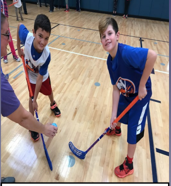
Students in Stratford Road got to experience a new unit this fall called floorball.